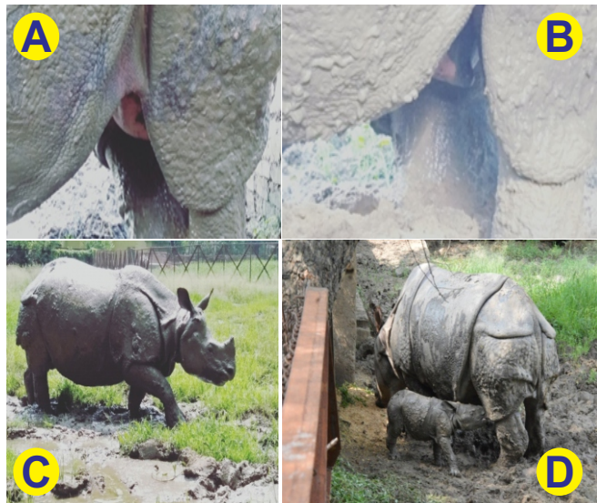
Fig. 1: Showing udder (a) and teat (b) visible from a distance from inguinal fold (c) the abdomen became bulky (d) Live male calf delivered on day 472 of gestation.

Physically, the greater one-horned rhinoceros appeared substantial, with her abdomen becoming more pronounced by day 462 (11 days before calving), her udder and teats had enlarged and were visible from a distance between the inguinal folds, regardless of the viewing angle (Fig.1a, b & c). By day 465 (eight days before calving), she mostly preferred to stay in the area where she had anticipated delivering her calf. This was her fourth parity, and the male calf was born in the early morning (23/06/2020) after completing a gestation period of 472 days (Fig.1d). The labor process, from onset to completion, lasted approximately 40 minutes. Throughout the last month of gestation, estrogen levels gradually increased, with a significant spike to 234.56 ng/g observed 48 hours before calving (Fig. 2). At the same time, progesterone levels remained relatively stable until the final days, when a marked decrease to 1034 ng/g was recorded 48 hours before parturition. These hormonal shifts reflect the physiological adjustments necessary for the onset of labor in the greater one-horned rhinoceros.